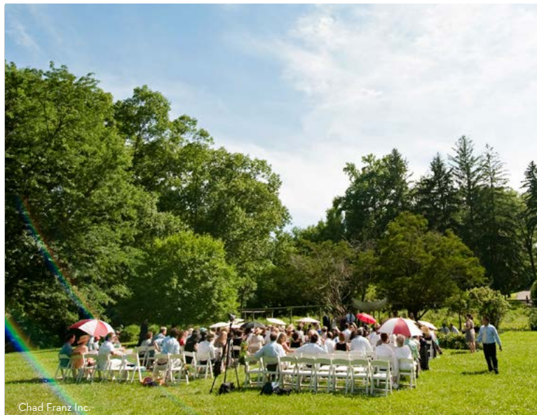
Chad Franz Inc.