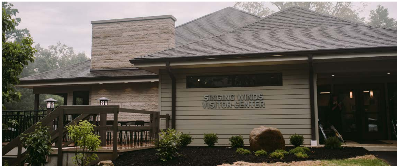
VISITOR CENTER ENTRY