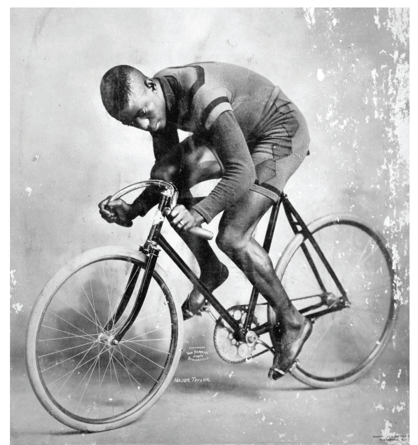
Indiana State Museum and Historic Sites

7 1896 CAPITAL CITY TRACK Major Taylor set a mile record at the Capital City Track. Corner of West 38th St. and the Monon Trail