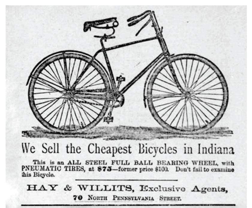
Indianapolis Journal, July 3, 1893 page 3

5 1892 HAY & WILLITS DEALERS IN BICYCLES SECOND LOCATION The bicycle store was at this location in 1892. 70 N. Pennsylvania St.