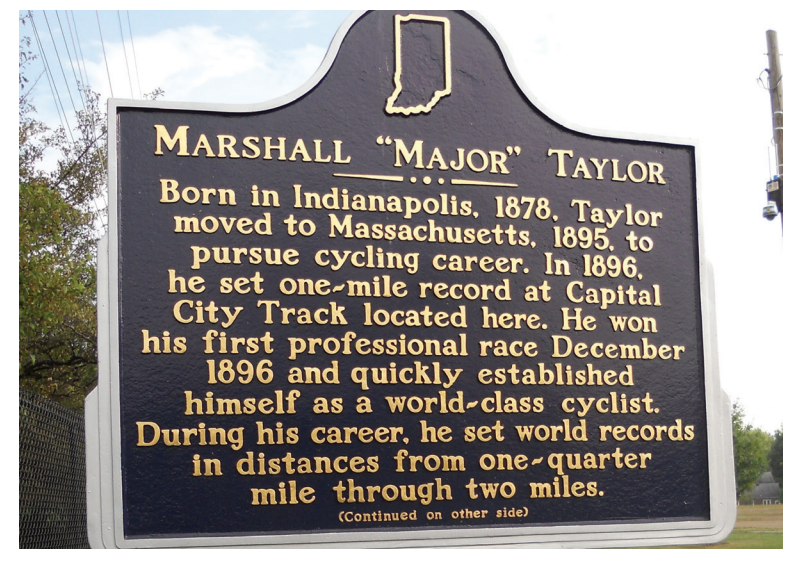
Indiana Historical Bureau, a division of the Indiana State Library

7 2021 NEWBY OVAL STATE HISTORICAL MARKER Fall Creek Parkway Trail Just east of 31st Street